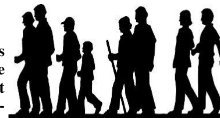
"Giving feet to the faith of the church"